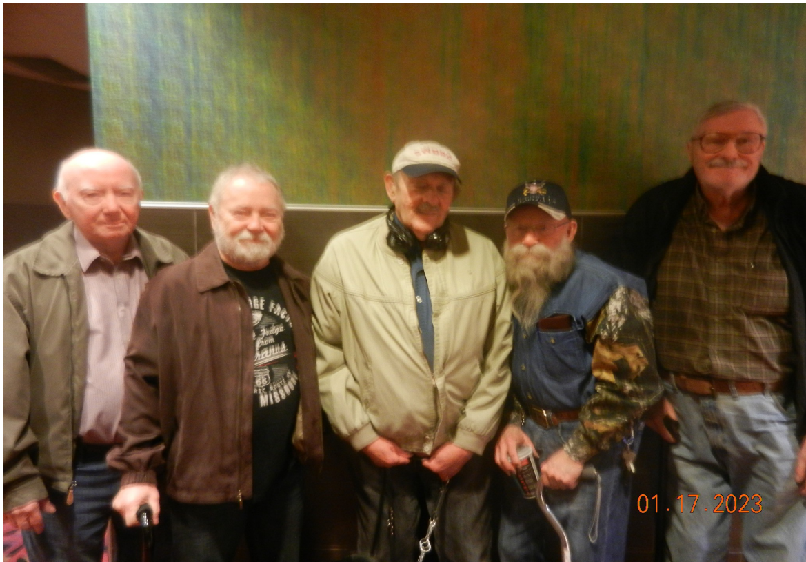
TAPT members at the movie