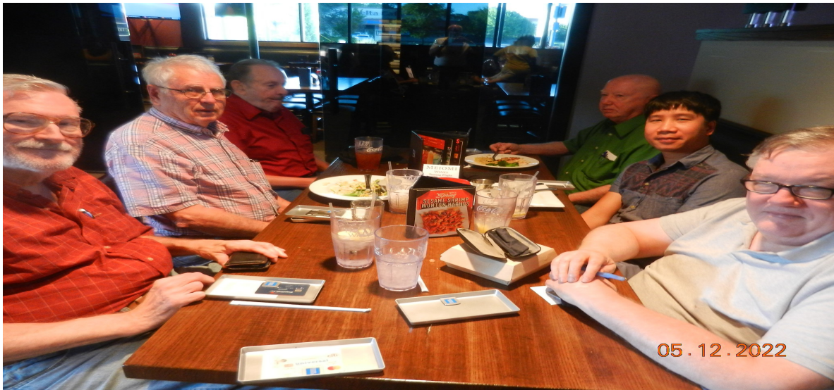
TAPT members hamming it up for the camera