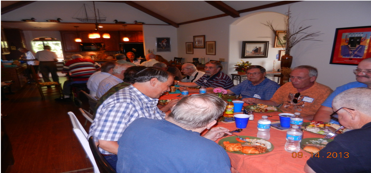
PrimeTimers at TAPT 20 Anniversary Party at Murrel Wilmoth in 2013. What can we do with our 30 Anniversary in 2023?