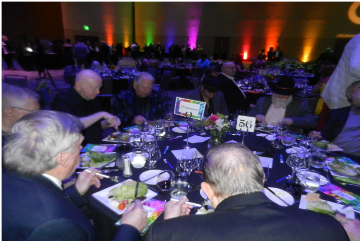
PrimeTimers at OKEQ Gala 2022. Are you at the table for 2023?