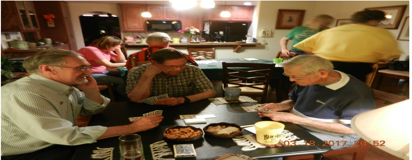
Prime Timers counting their hand at Game Night