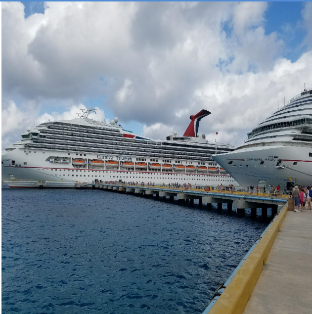
This the floating resort our four Prime Timers had part of. What a way to kick back and enjoy fellow Prime Timers.