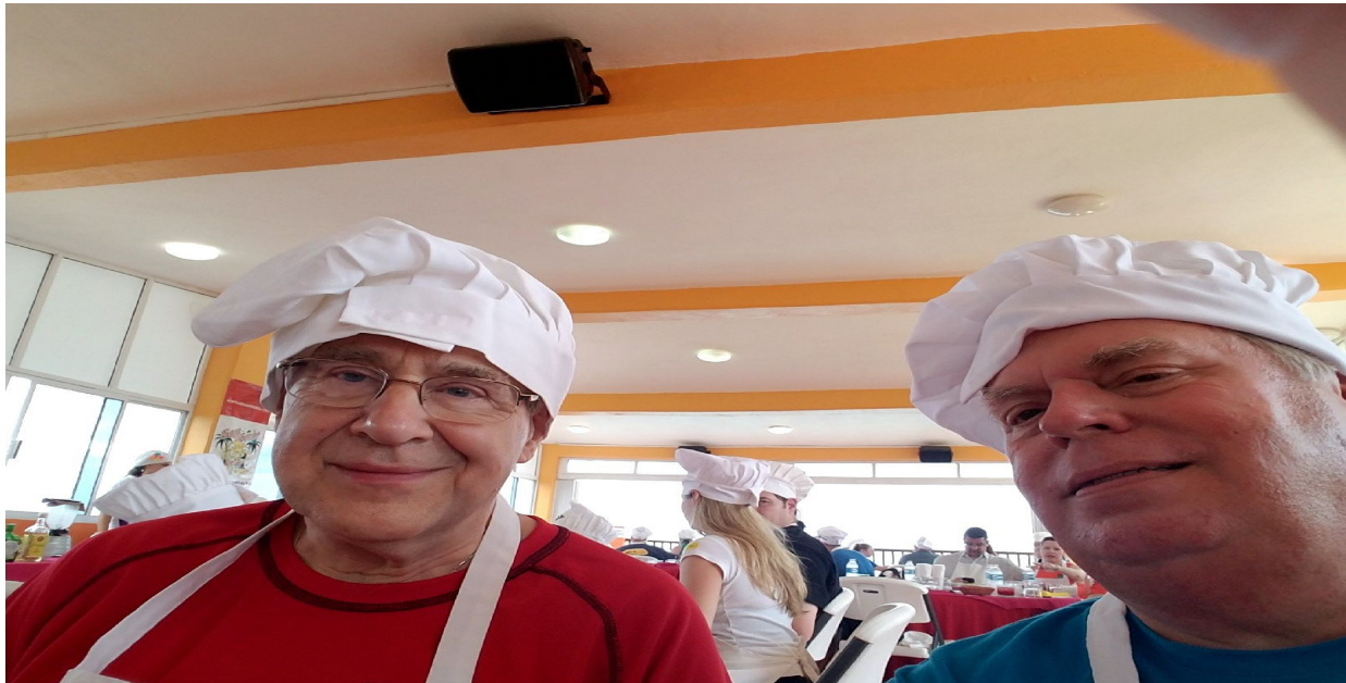
Prime Timers having fun on April cruise.