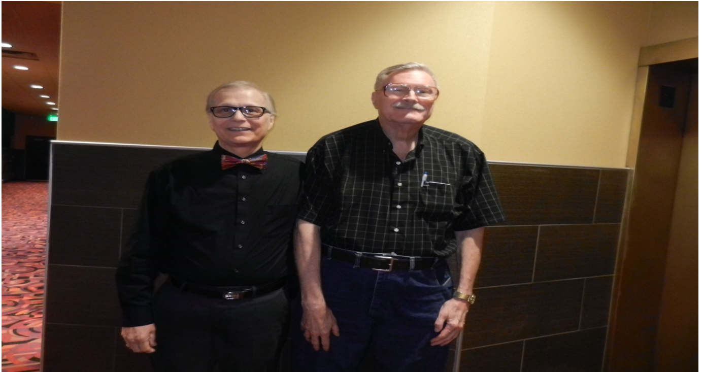
TAPT members after movie night Beauty and Beast