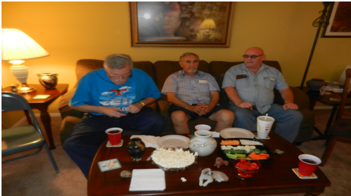
TAPT members waiting for the movie to start at Norman's