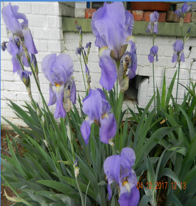
May flowers in April Just weather in Oklahoma