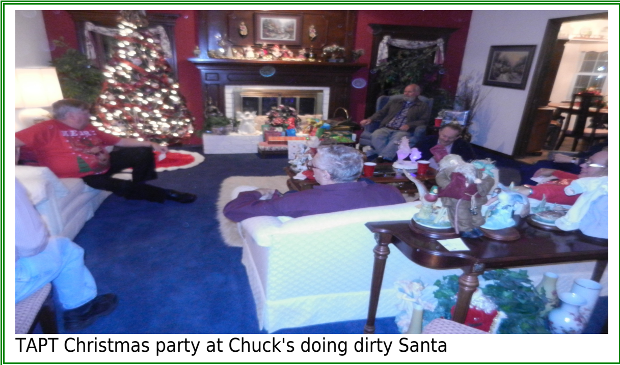
TAPT Christmas party at Chuck's doing dirty Santa