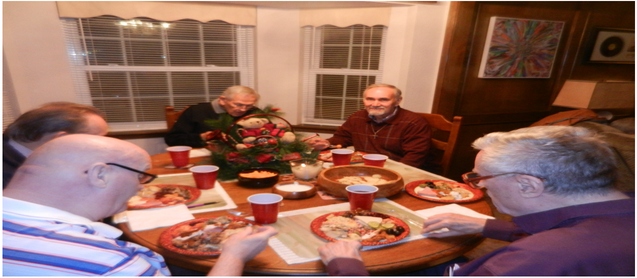
TAPT members enjoying Christmas party 2017