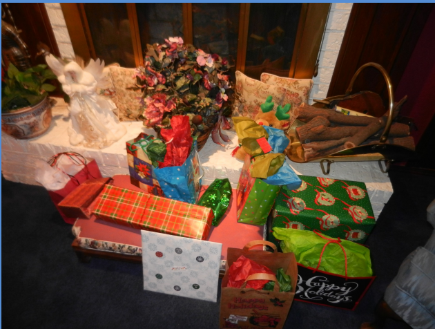
Prime Timers putting bait out for Santa Clause. Tulsa members had a great time exchanging gifts then left poor Santa stuck in the chimney.