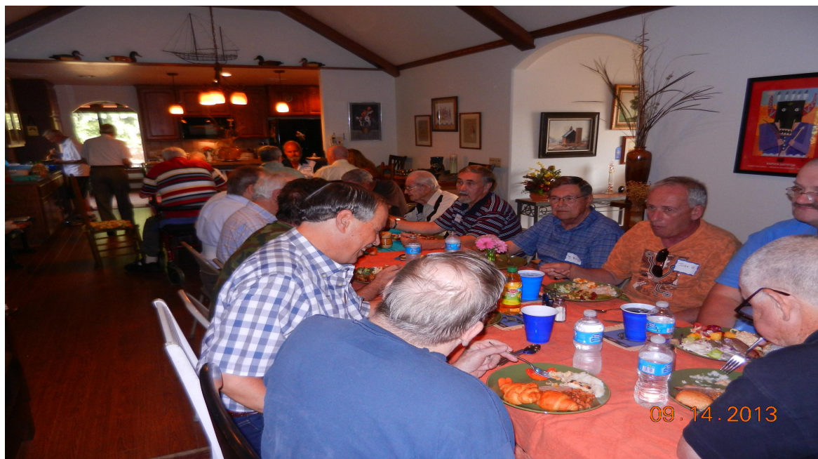
TAPT celebrating our 20 th anniversary