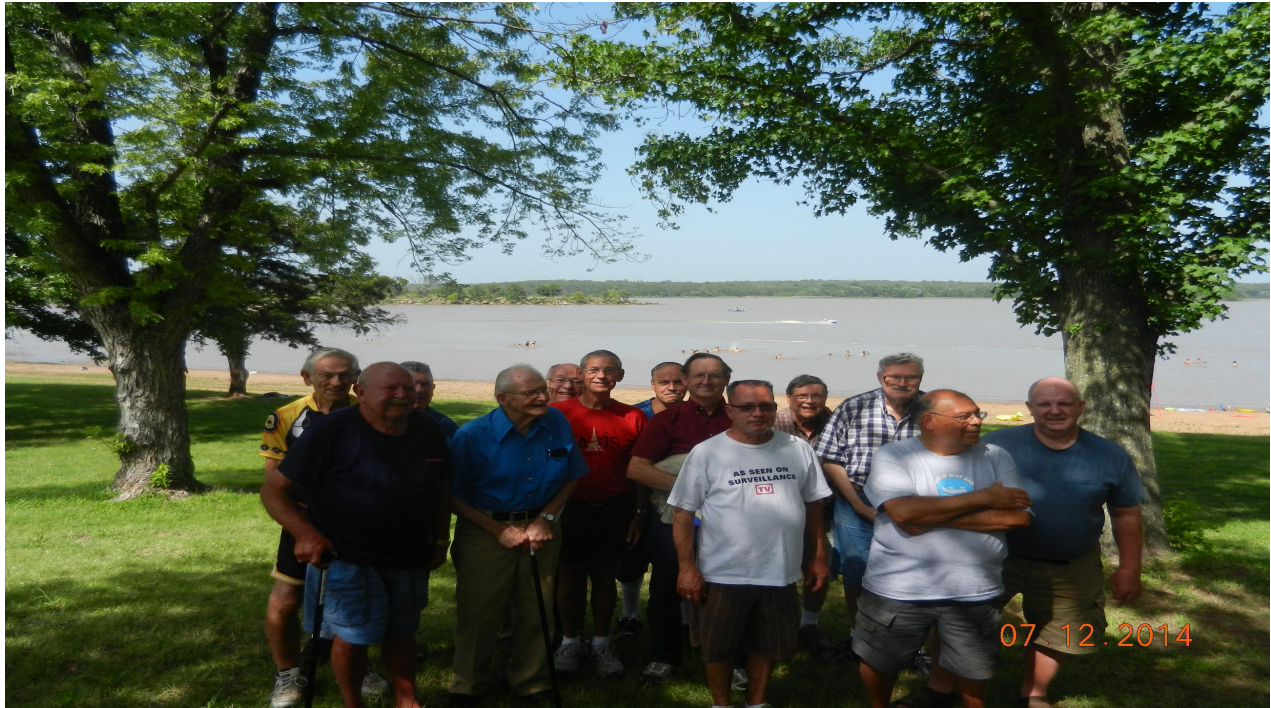
Prime Timers enjoying summer at the lake

A farmer near Dubbo got pulled over by a Highway Patrol Officer for speeding. The officer started to lecture the farmer about his speeding, and in general began to throw his weight around to try to make the farmer feel uncomfortable. Finally, the officer got around to writing out the ticket. As he was doing that, he kept swatting at some flies that were buzzing around his head. The farmer said, "Having some problem with circle flies there, are ya?" The officer stopped writing the ticket and said, "Well yeah, if that's what they are. I never heard of circle flies." So the farmer says, "Well, circle flies are common on farms. See, they're called circle flies because they're almost always found circling around the back end of a horse." The officer says, "Oh," and goes back to writing the ticket. Then after a minute, he stops and says, "Are you trying to call me a horse's ass?" The farmer says, "Oh no, officer. I have too much respect for law enforcement and police officers to even think about calling you a horse's ass." The officer says, "Well that's a good thing," and goes back to writing the ticket. After a long pause, the farmer says, "Hard to fool them flies though".