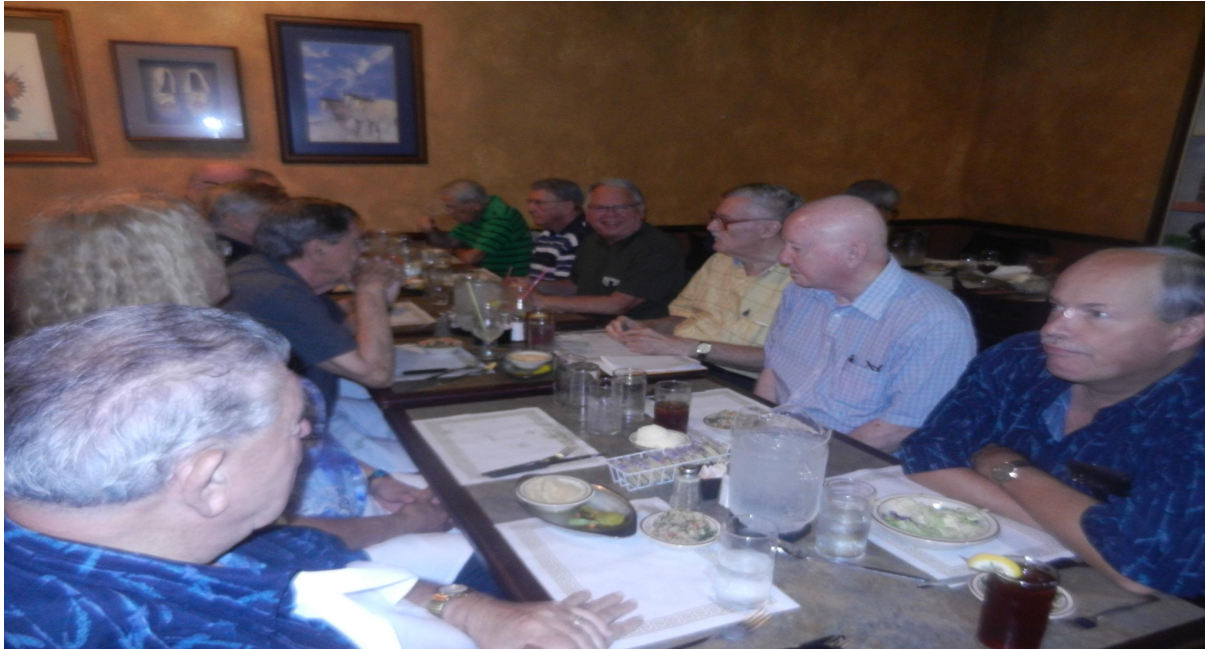
TAPT 25 th Anniversary Party