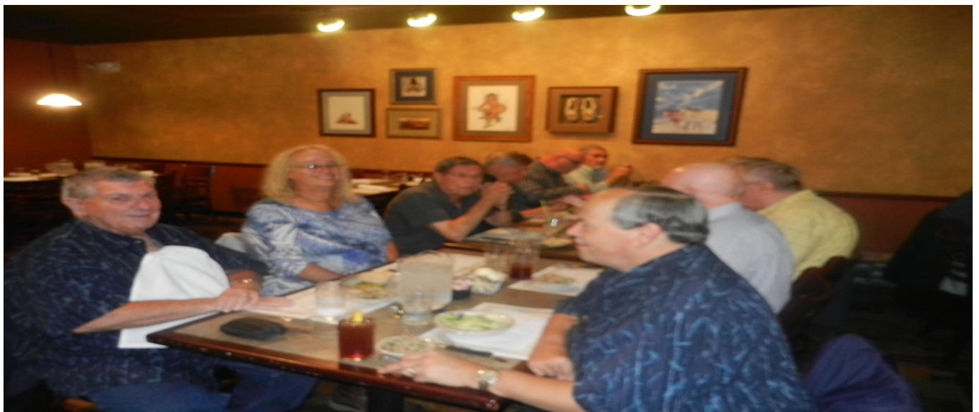
TAPT members and guests having great time at 25 th Anniversary party.