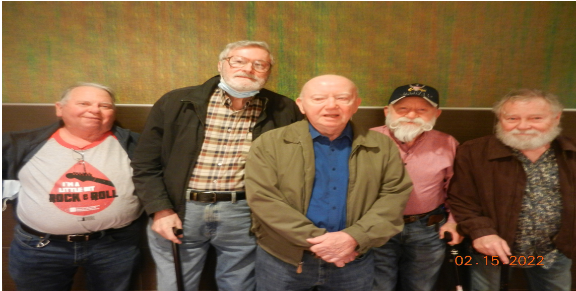
TAPT movie watcher's after seeing Death on the Nile