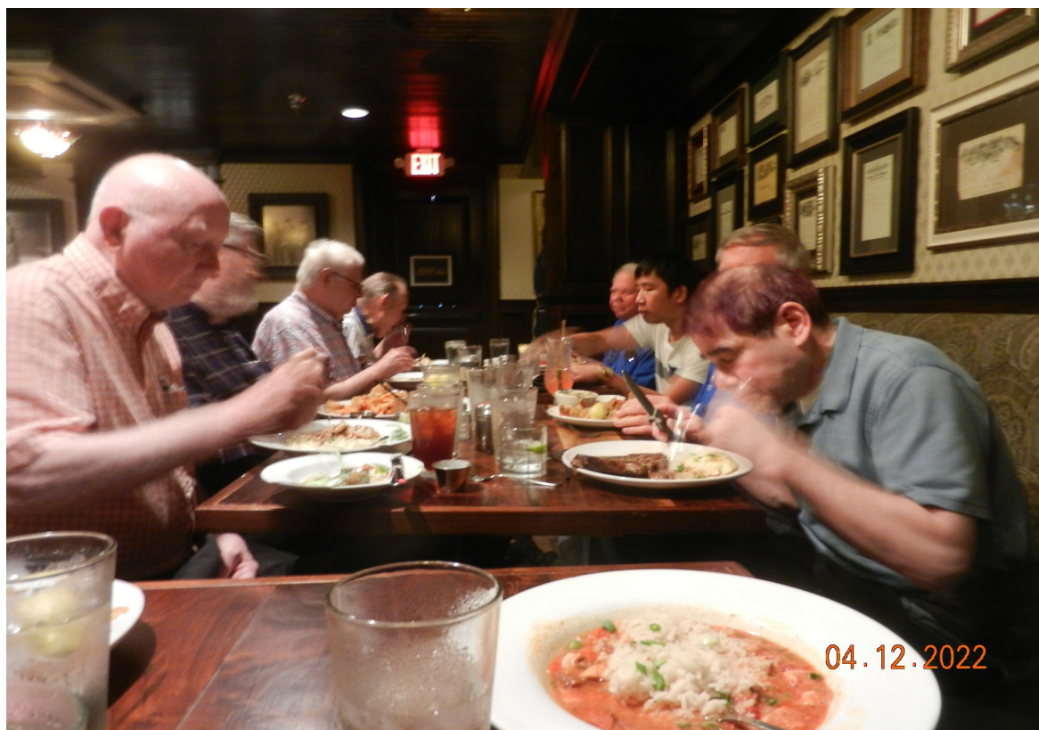
PrimeTimers at April Dine out Nola's