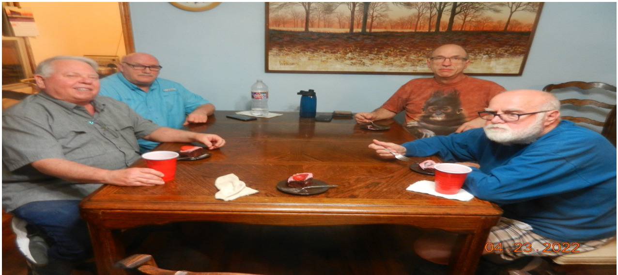
PrimeTimers and friends at game night