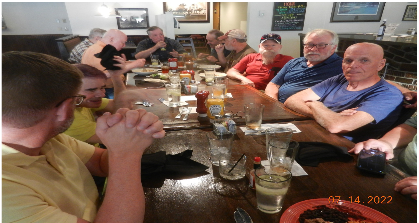
Prime Timers having fellowship