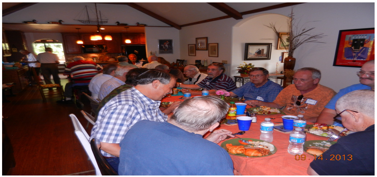
PrimeTimers at TAPT 20 Anniversary Party at Murrel Wilmoth in 2013. What can we do with our 30 Anniversary in 2023?