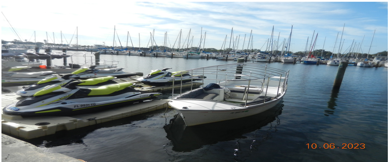
One of the marinas in St Petersburg Florida. Sense of warmth in January