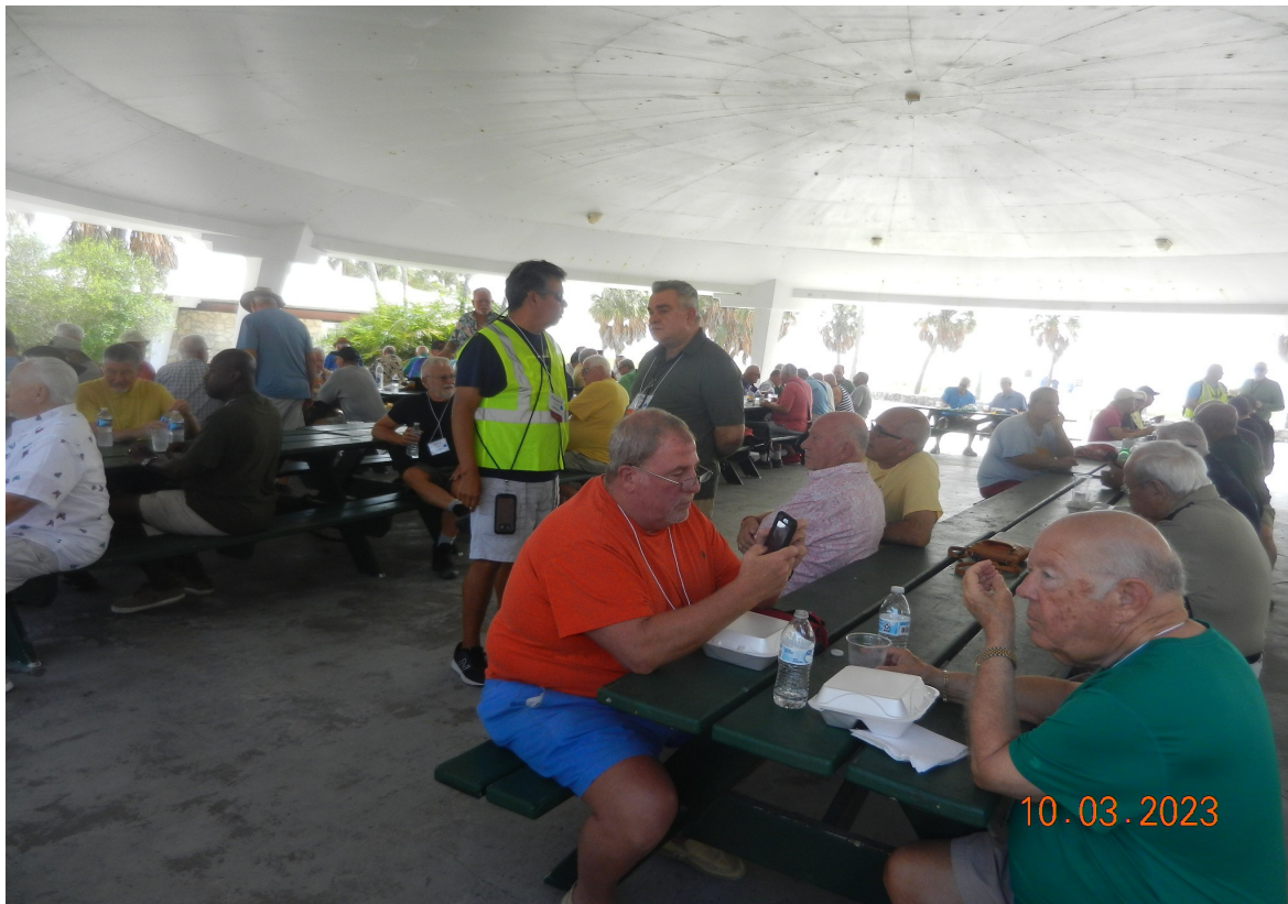
Prime Timers enjoying trip to beach in St Petersburg Florida