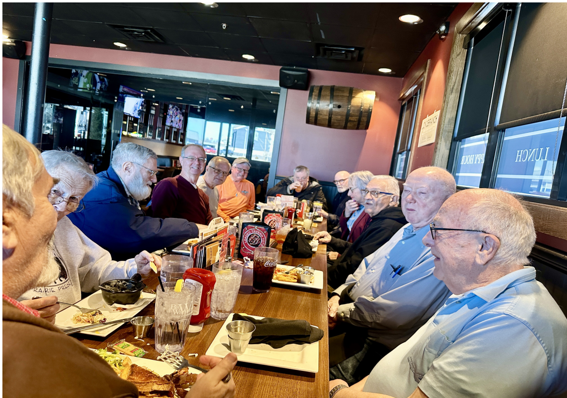
TAPT turned out for our February Lunch bunch at Big Whiskey's