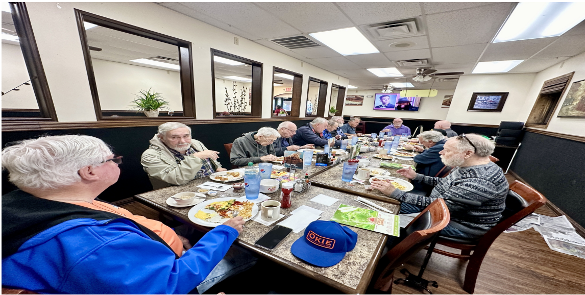
Prime Timers at breakfast enjoying a great visit and good food