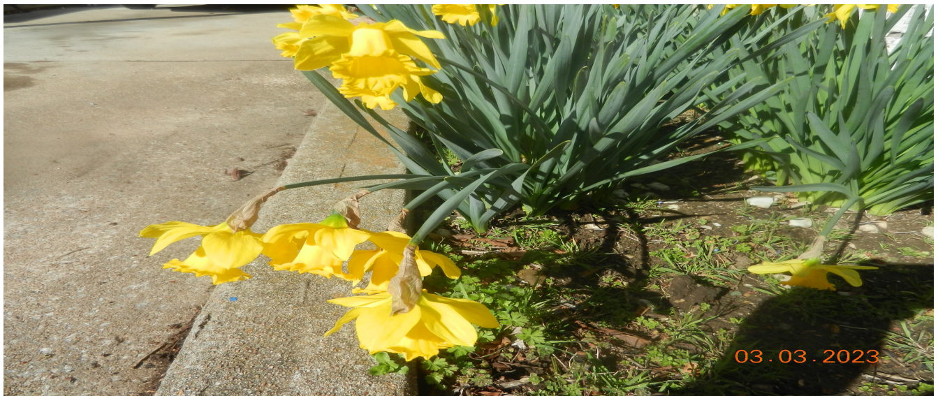
Spring has sprung in Oklahoma