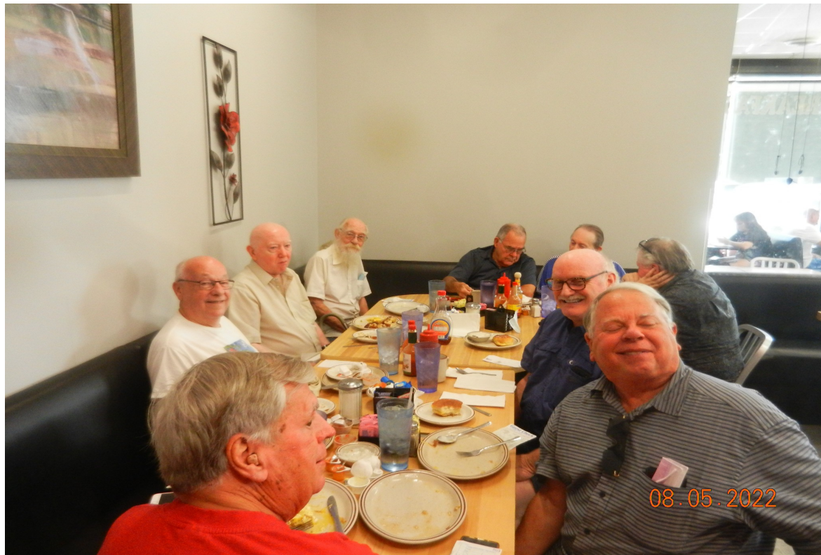
TAPT members enjoying a meal and each other. See those smiles