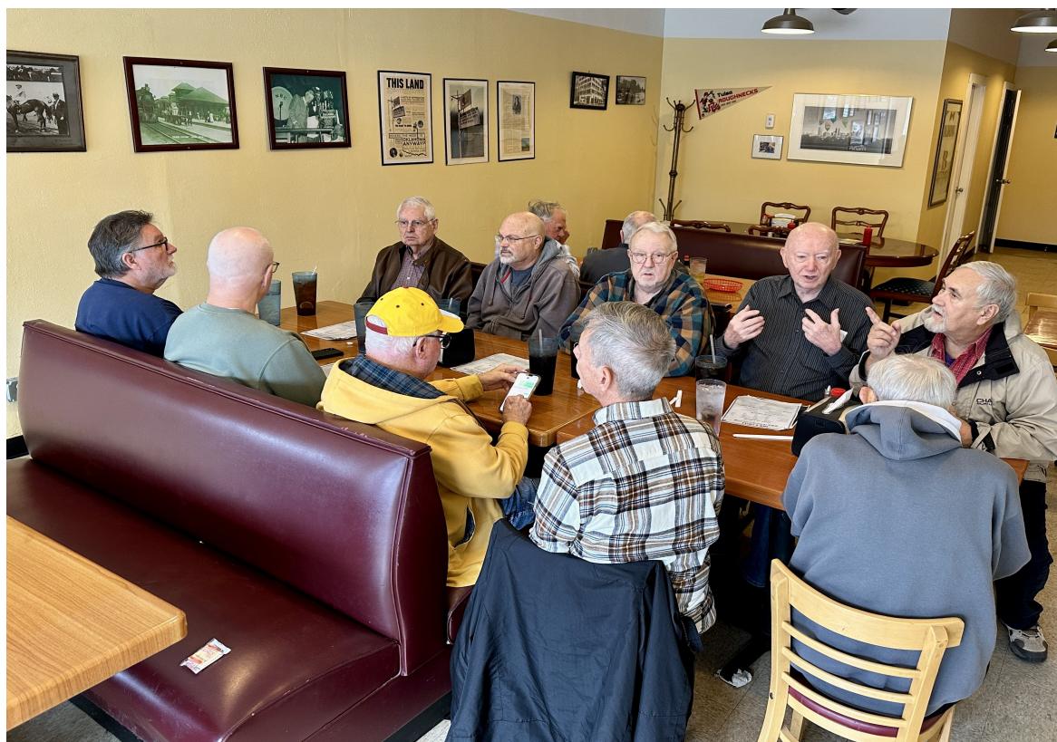
TAPT members having chili and fellowship at Ike's