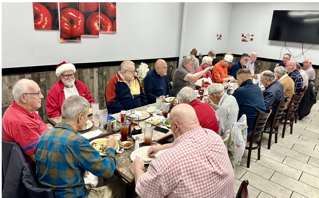
Prime Timers at TAPT Christmas party. All for Santa