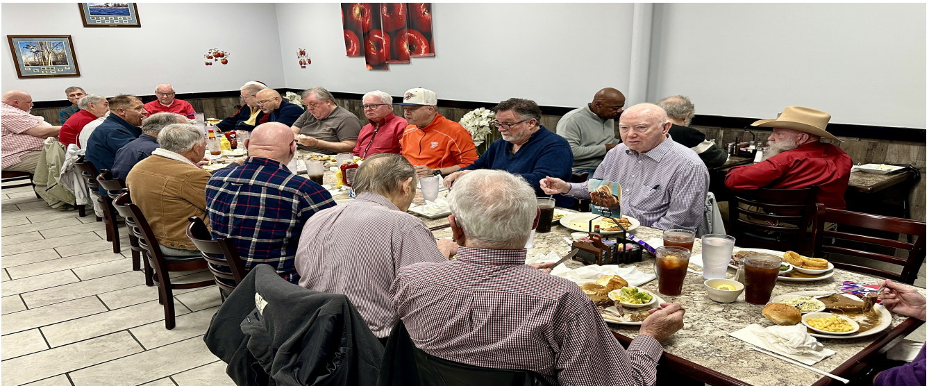
TAPT Christmas party spreading the joy

When you don't feel that you have to be perfect to be accepted, when you are given the freedom to be yourself in every situation, when you can share your heart without the risk of betrayal, when being together is more important than what you do...that is when you're in the presence of a friend.