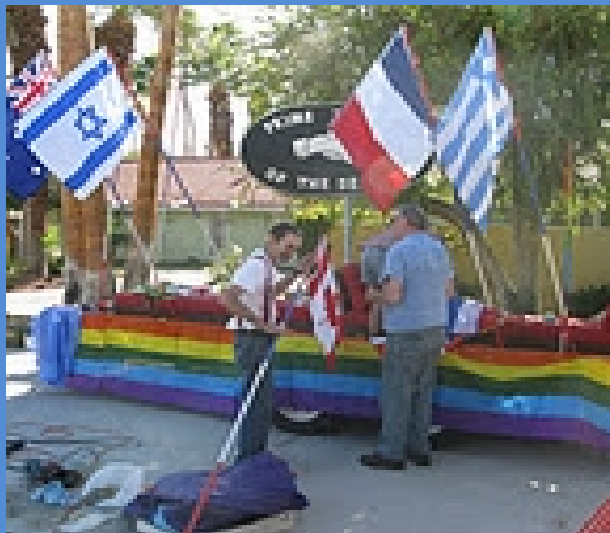
Parade at the 2011 Convention in Palm Springs