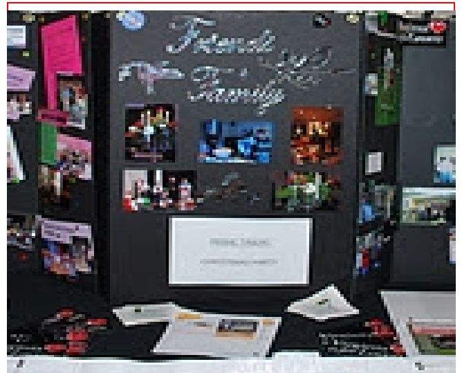
Worldwide Convention 2011