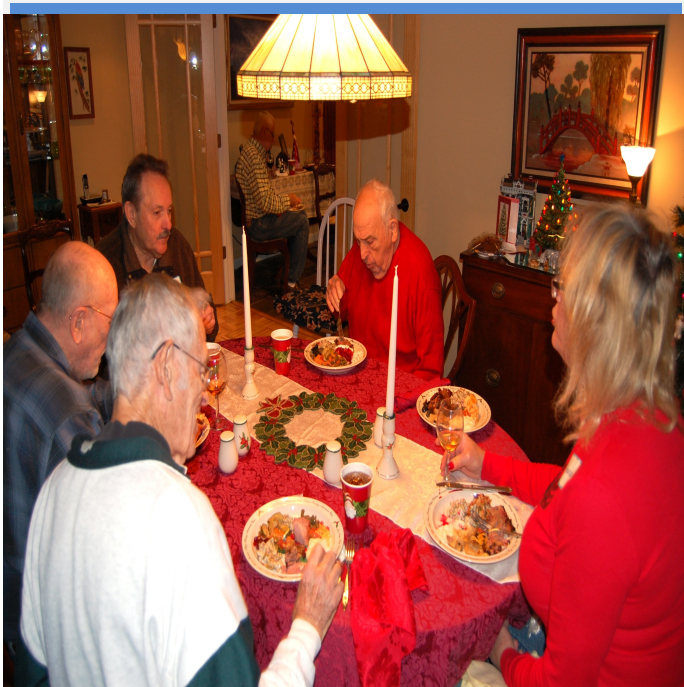
To Full to talk TAPT Christmas Party 2011