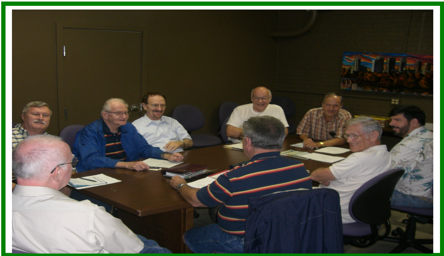
Who told a Joke during TAPT monthly meeting?