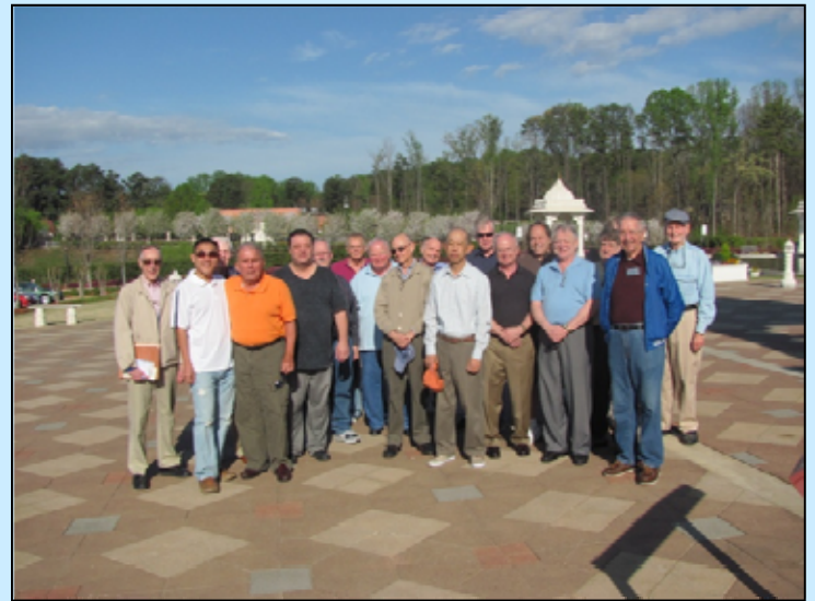
Atlanta Prime Timers visit to the Mandir