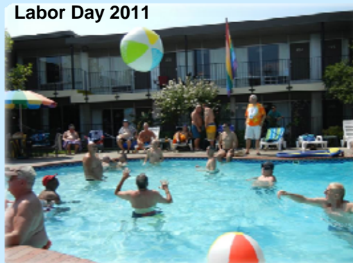
Labor Day 2011

For more information and a registration form click here if you are reading online, or send an email to ptlabor-day@aol.com .