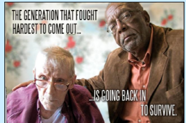
A poster for Gen Silent, a documentary about the hard choices LGBT elders fear

It is your board's intent to move forward working with other senior LGBT organizations to make sure we don't have to turn our back on our lives and friends, in order to get continuing high quality health care, and safe and affirming living arrangements. At the Presidents' meeting in Palm Springs last November, the chapters voted to pursue a tax exempt status as a charitable organization (often known as a 501(c)3 organization). That will help us