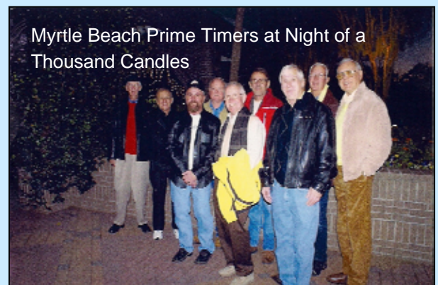
Myrtle Beach Prime Timers at Night of a Thousand Candles

Also, please mark your calendars for Sept 8 th our annual beach picnic! It will be held at shelter #B-5.