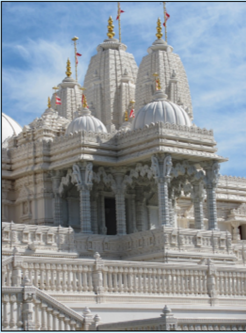
The BAPS Shri Swaminarayan Mandir