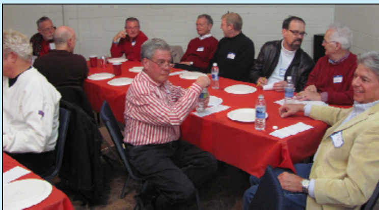
Atlanta Prime Timers at a recent chapter event

A membership achievement, you bet. An achievement all of us can be proud of, you bet. This is Atlanta Prime Timers.